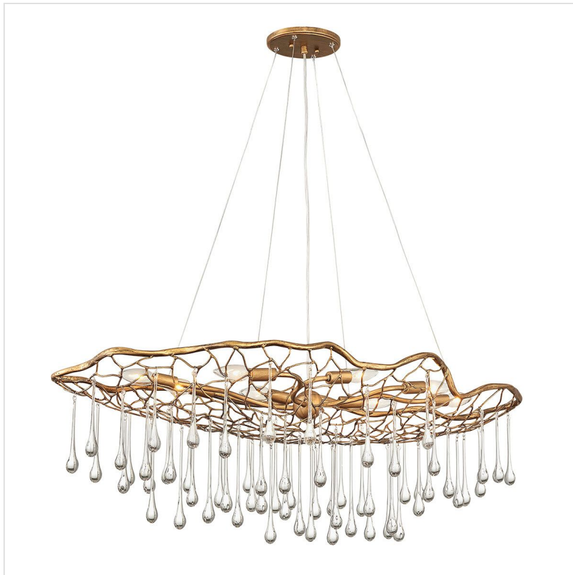
QN-LAGUNA-8P Laguna 8 Light Pendant Light - Burnished Gold