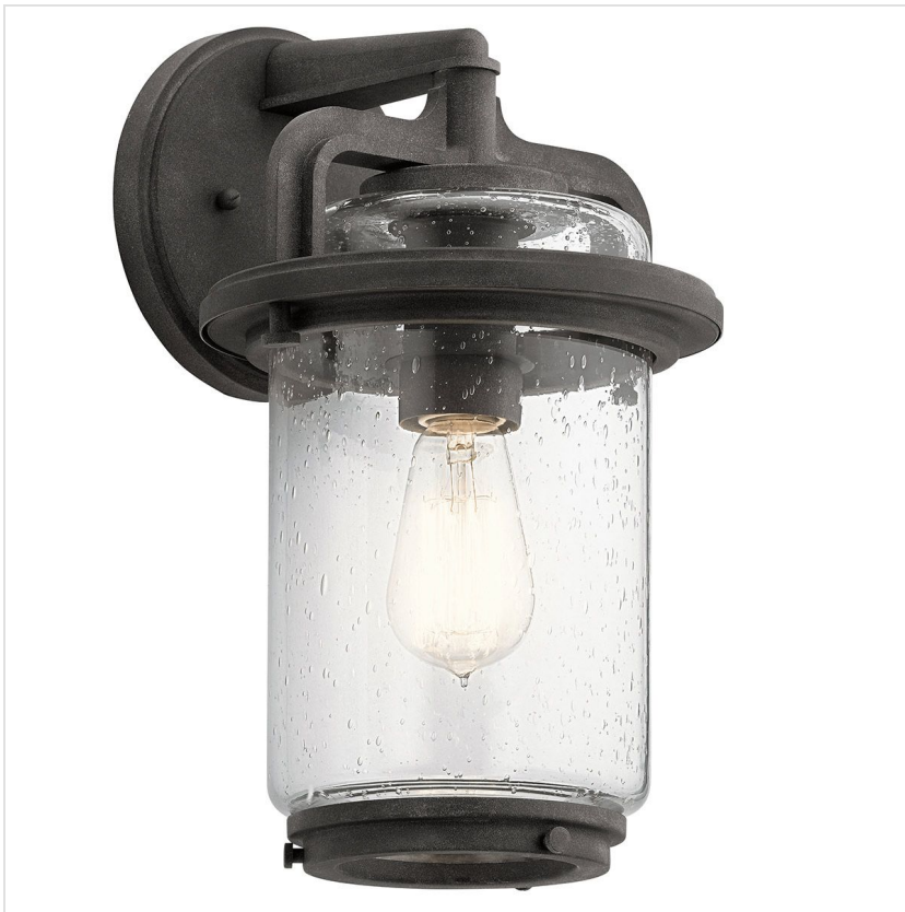
QN-ANDOVER-M Andover 1 Light Medium Wall Lantern - Weathered Zinc